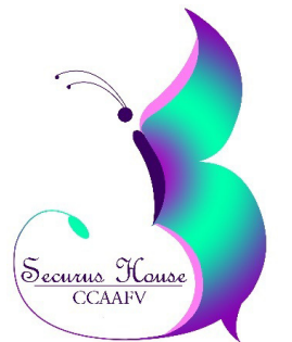
Clayton County Association Against Family Violence, Inc.

PLEASE NOTE: You may make monetary donations. Make your checks payable to Philadelphia Presbyterian and mark for Securus House, and place in the collection plate. Place your donations in the collection bins in the narthex. All gifts must be received by Sunday, April 29, 2018.