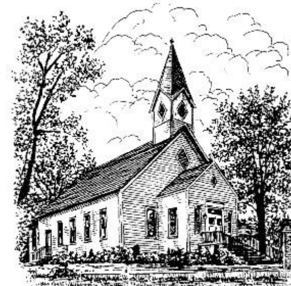
Philadelphia Presbyterian Church Clayton County, Georgia – Organized 1825

***Budgeted + Contributions from the Congregation